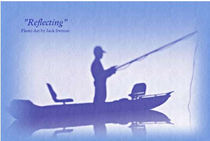
Jack Swersie's photo, Reflecting, will be on display at the Eastern Monroe Public Library in October and November.